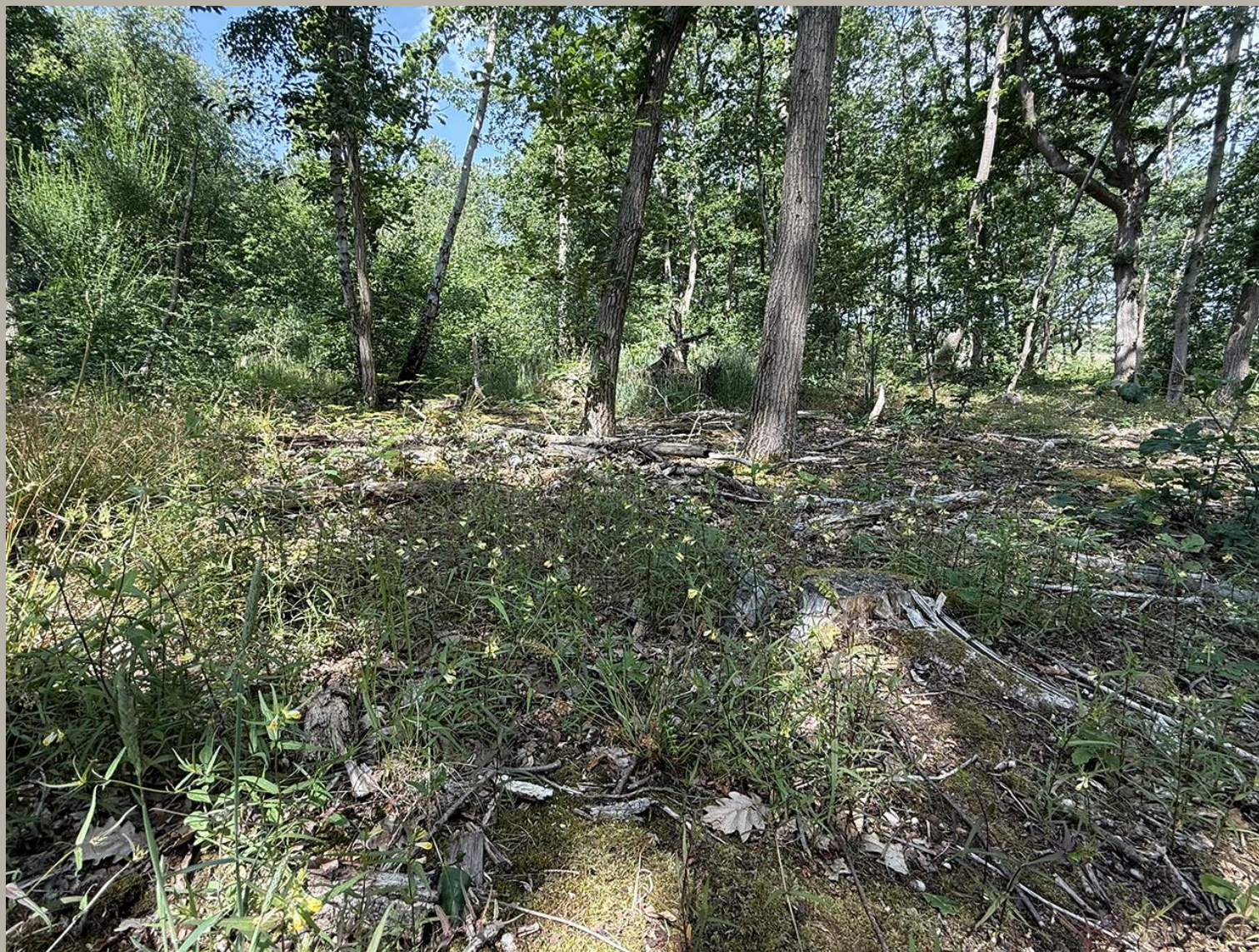
An open clearing of sparse vegetation in Blean Wood where Common Cow-wheat grows which is ideal for the Heath Fritillaries larva to feed on.