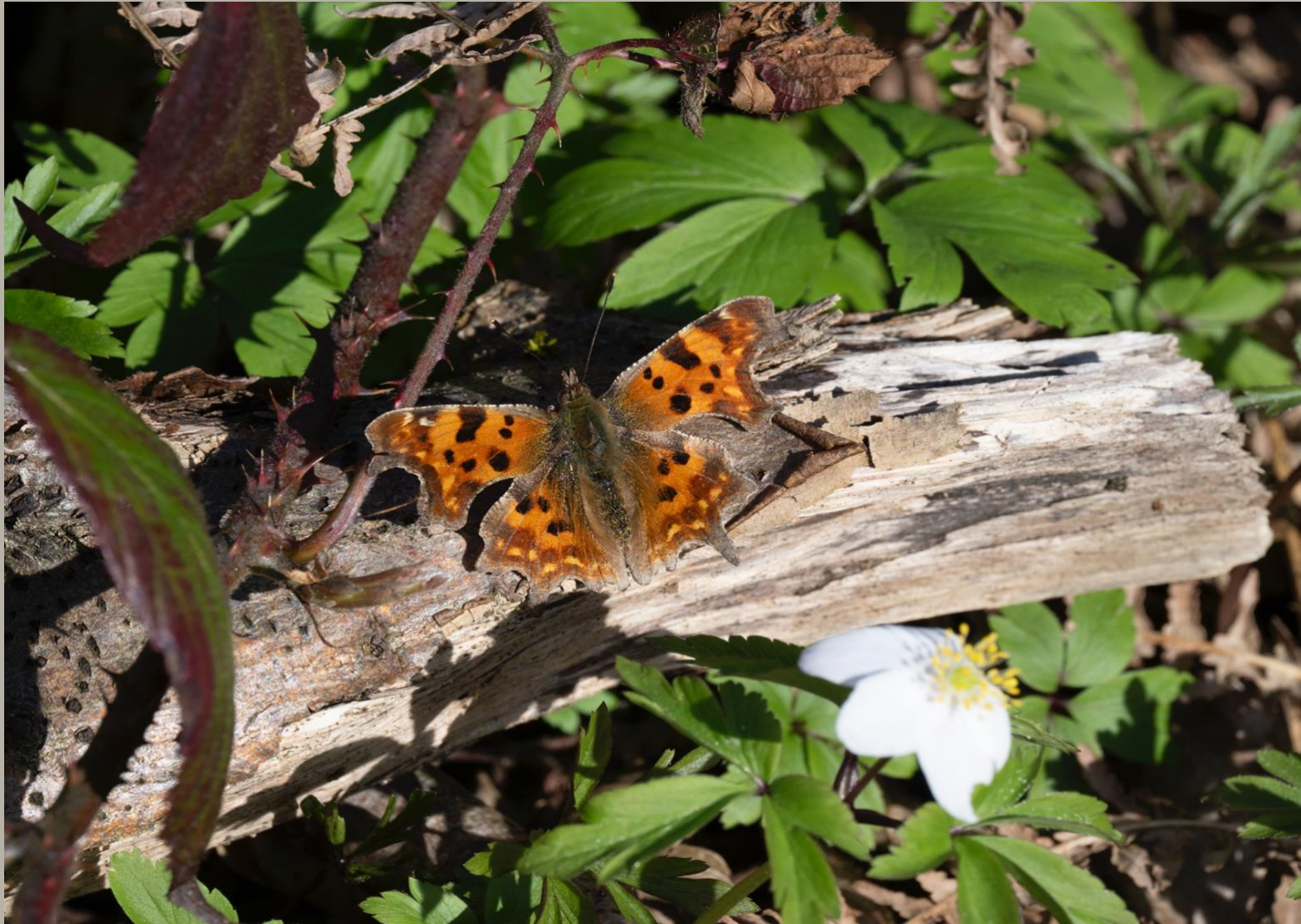
Comma ( Polygonia c-album )

Orlestone Forest, Faggs Wood - March '25