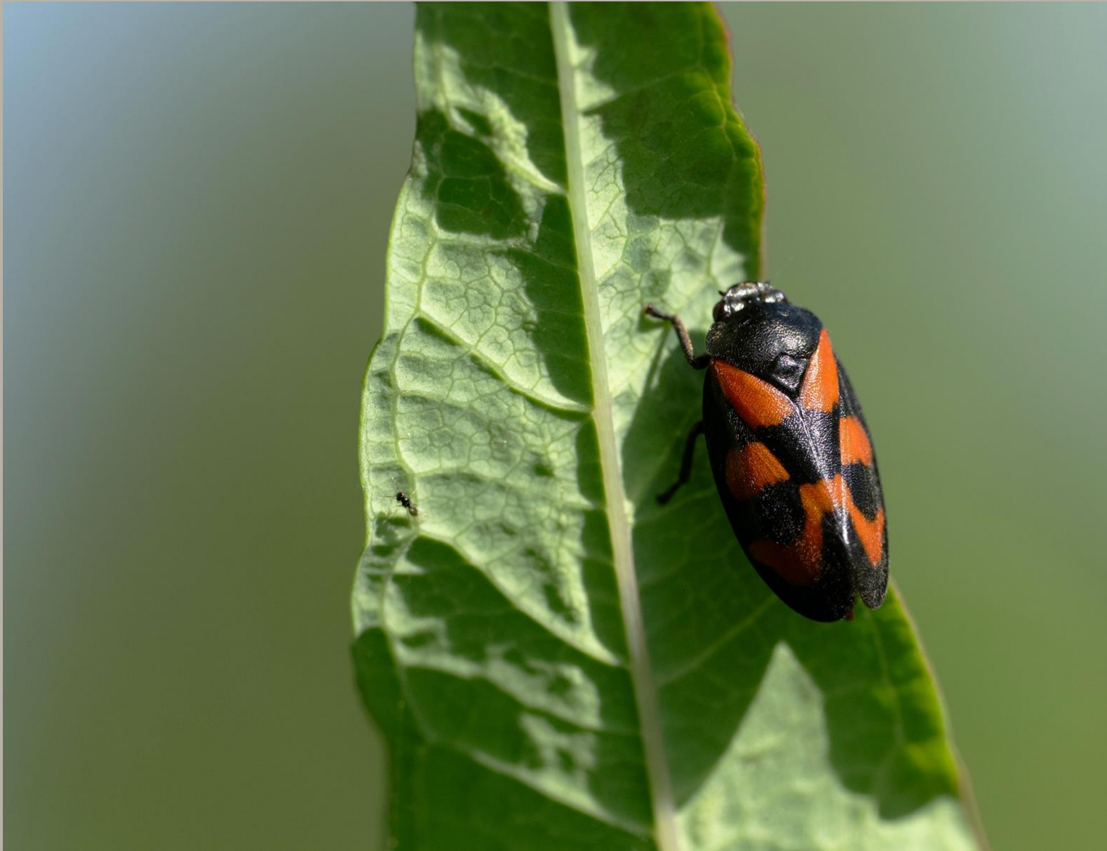
Red-and-black Froghopper ( Ceropis vulnerata )