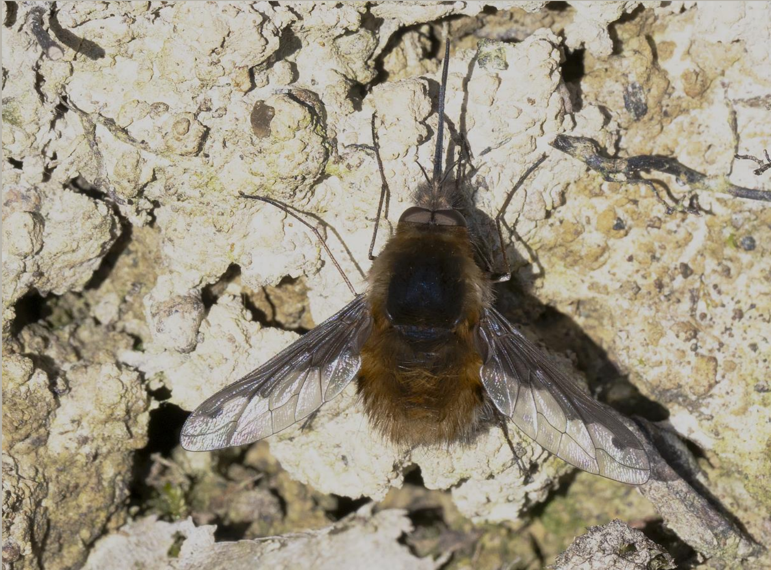
Dark-edged bee-fly ( Bombylius major )

Orlestone Forest, Faggs Wood - March '25