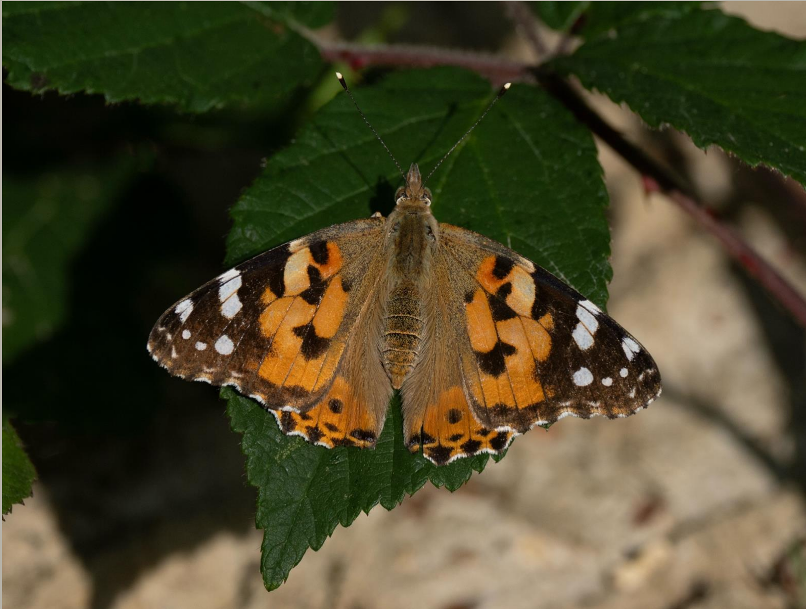
Painted Lady ( Vanessa cardui )