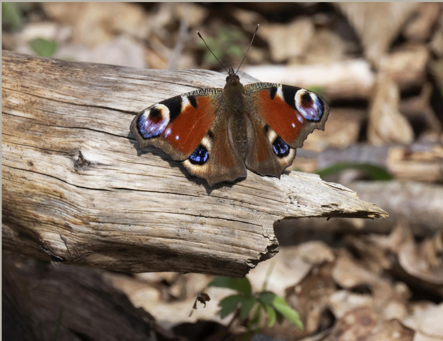
Peacock ( Aglais io )

Orlestone Forest, Faggs Wood - March '25