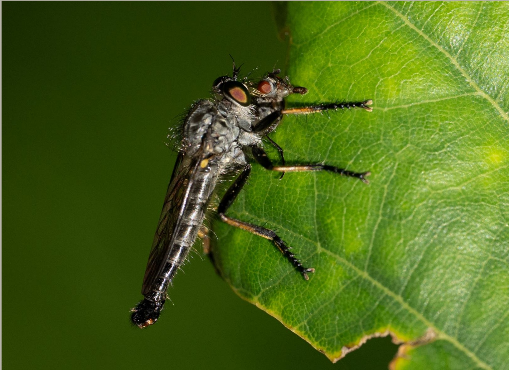
Common Awl Robberfly ( Neoitamus cyanurus )