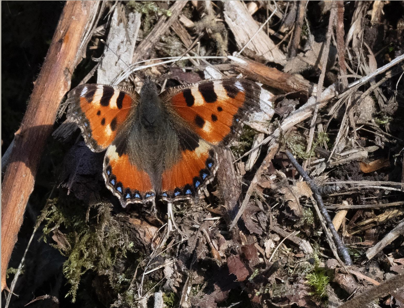
Small Tortoiseshell ( Aglais urticae )

Orlestone Forest, Faggs Wood - March '25