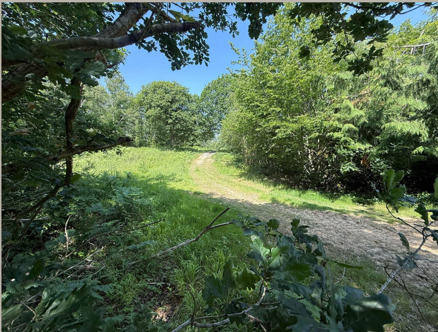
West Blean and Thornden Woods