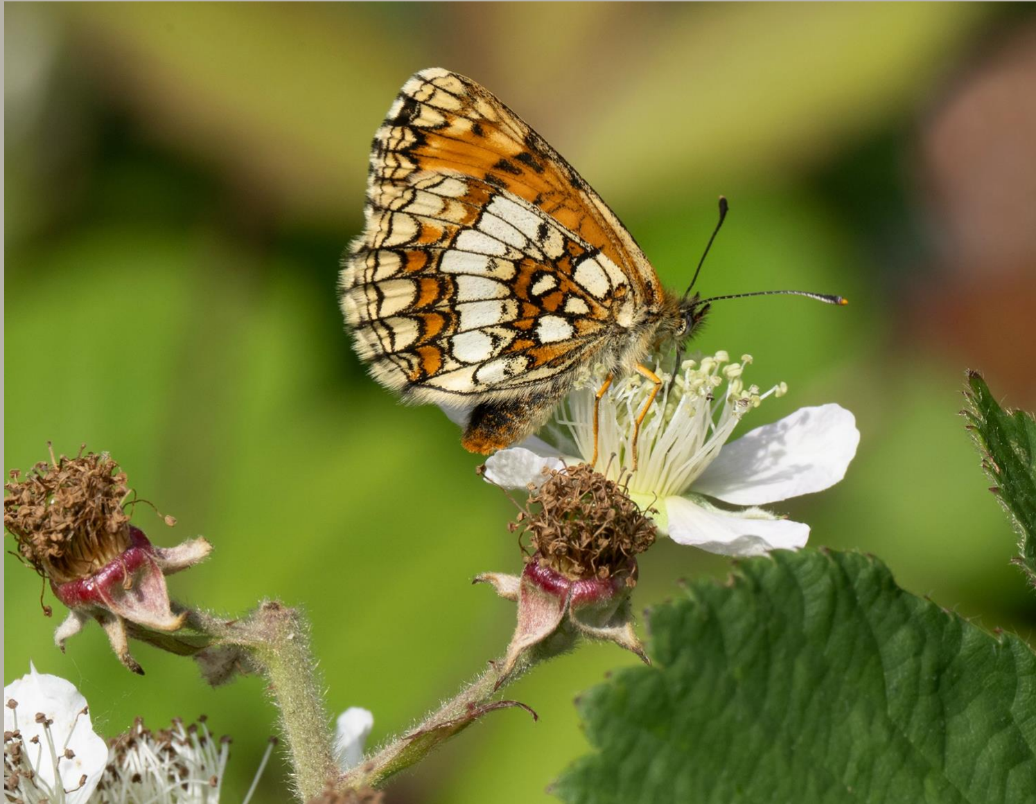
Heath Fritillary ( Melitaea athalia ) Underwing.