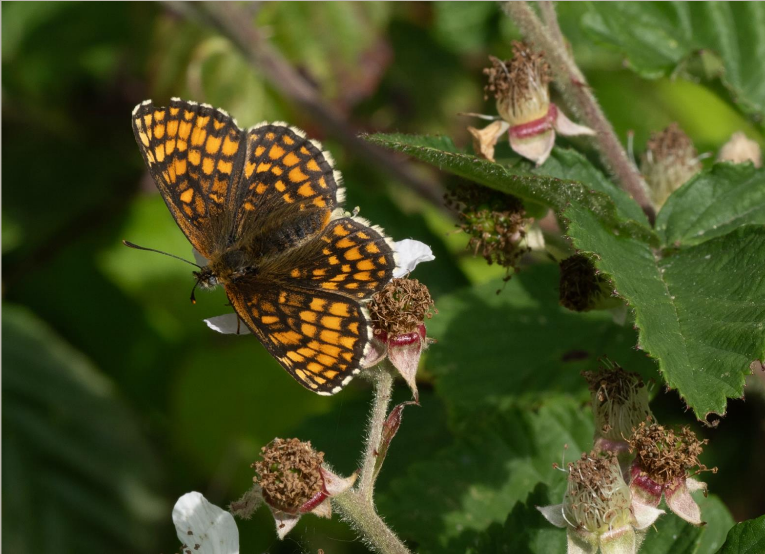
Heath Fritillary ( Melitaea athalia )