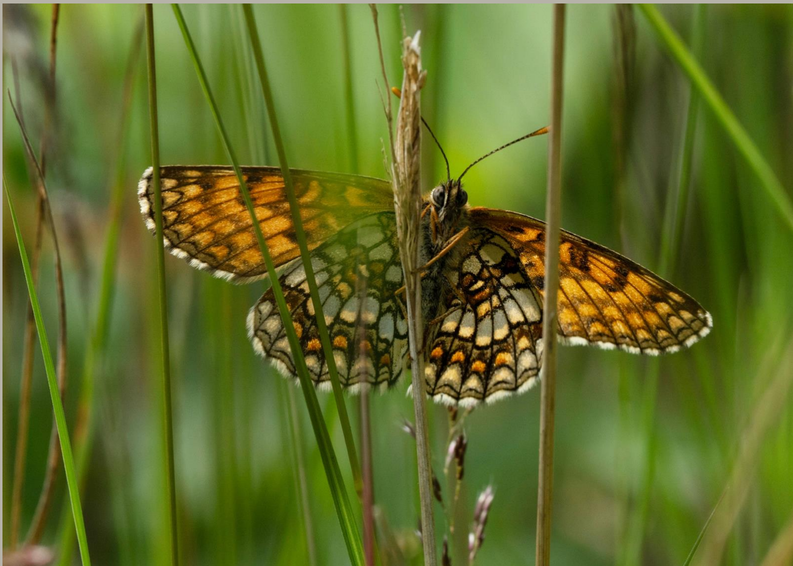
Heath Fritillary ( Melitaea athalia ) Underwing