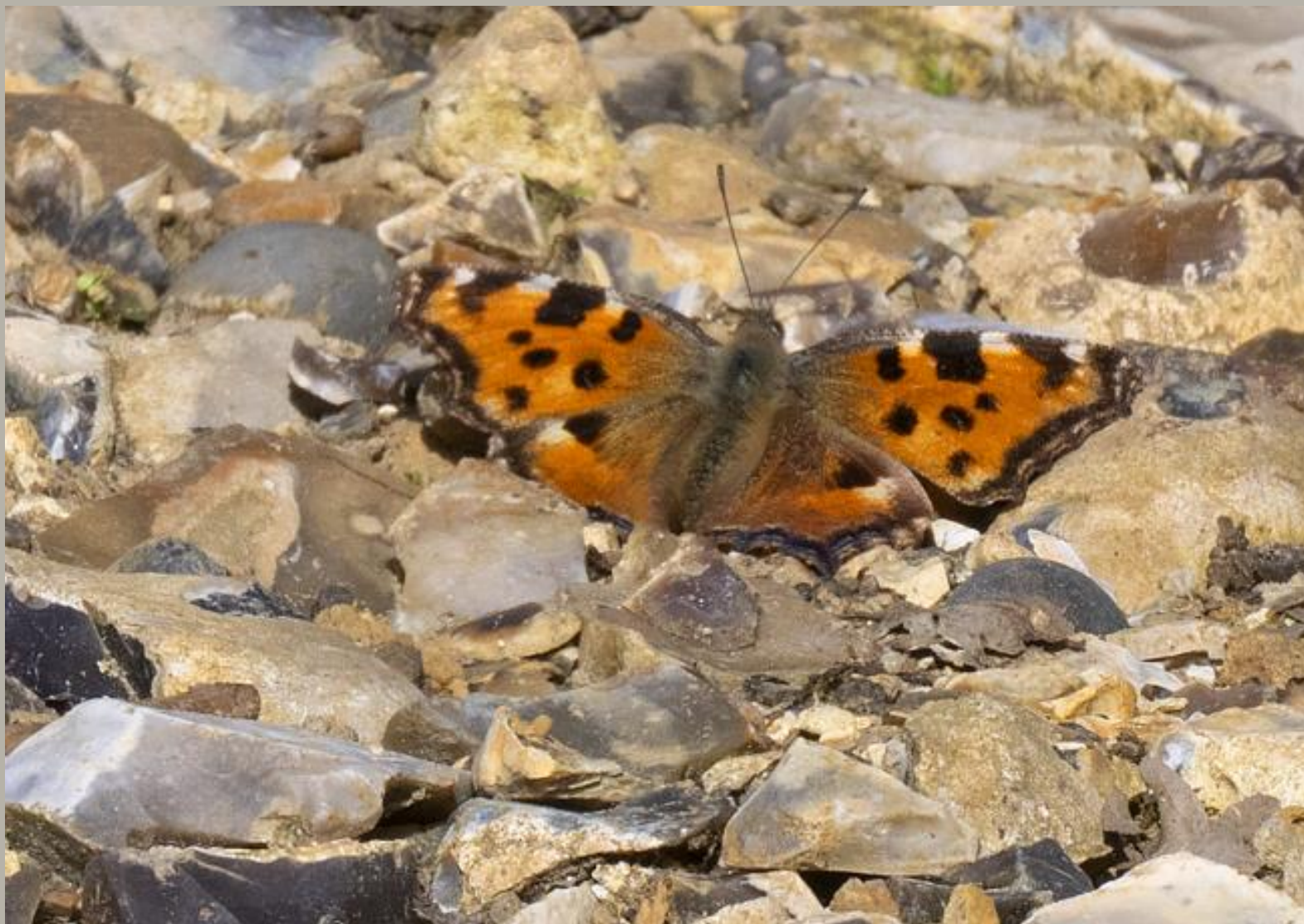
Large Tortoiseshell ( Nymphalis polychloros ).

Orlestone Forest, Faggs Wood - March '25