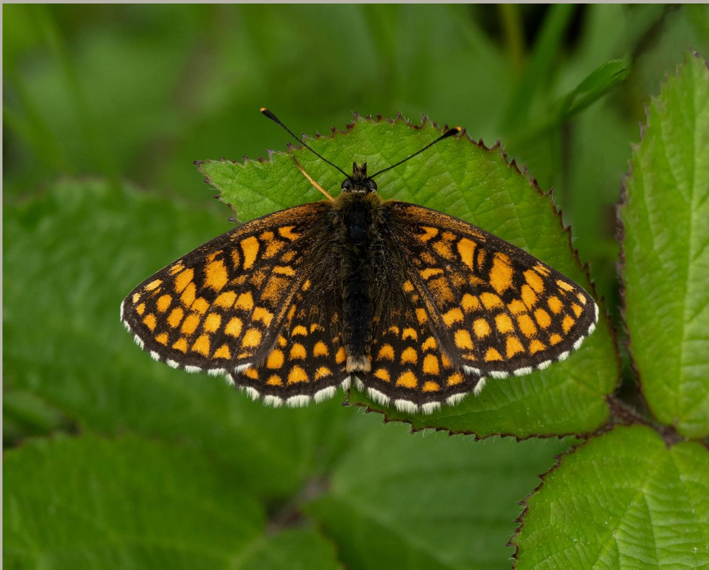
Heath Fritillary ( Melitaea athalia ) Underwing.