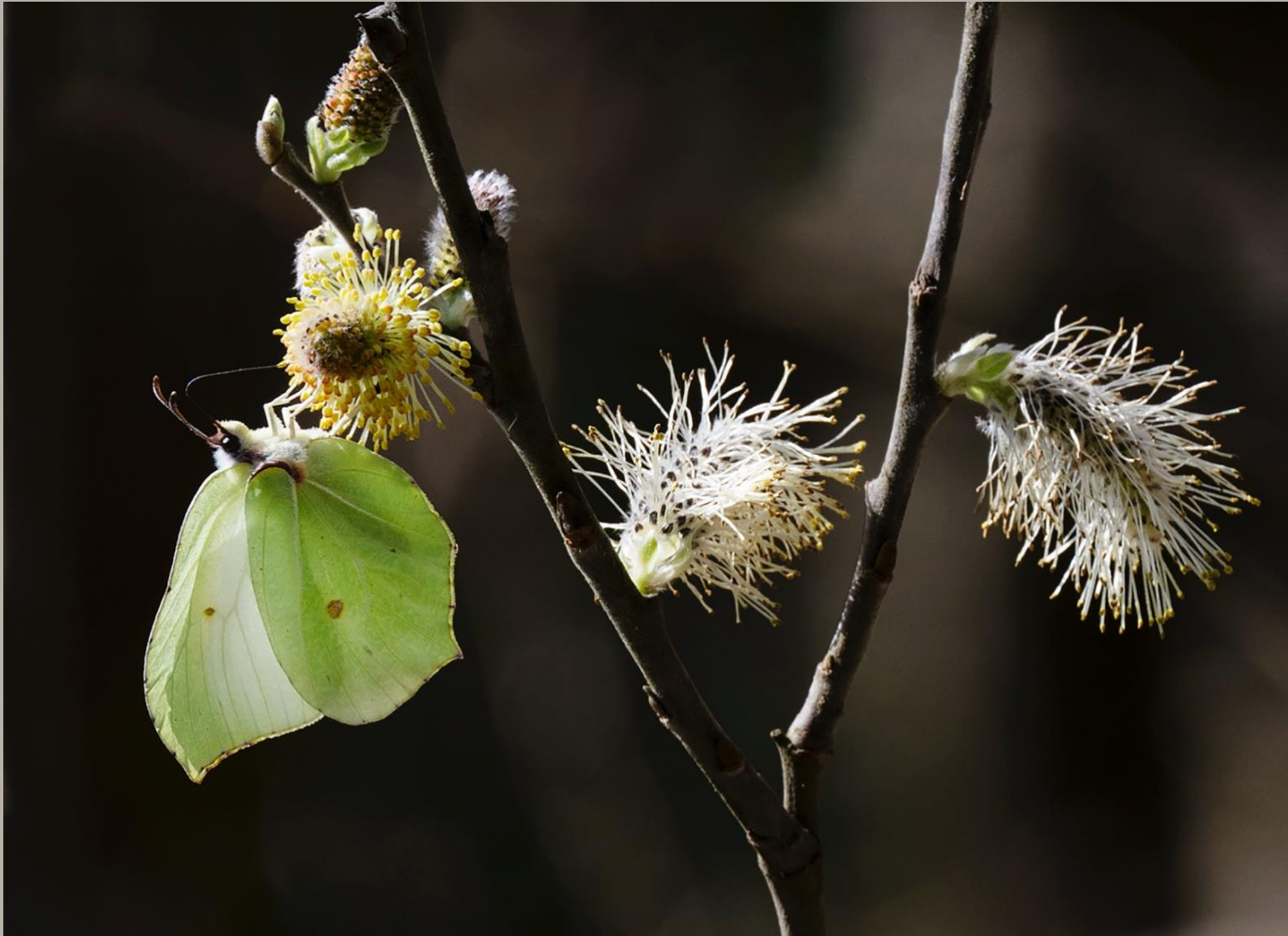
Brimstone ( Gonepteryx rhamni )

Orlestone Forest, Faggs Wood - March '25