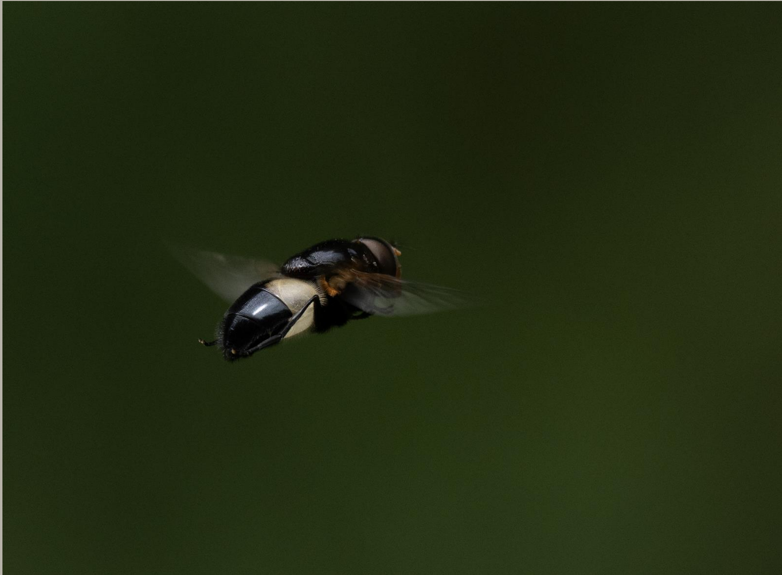
Pied Plumehorn ( Volucella pellucens )