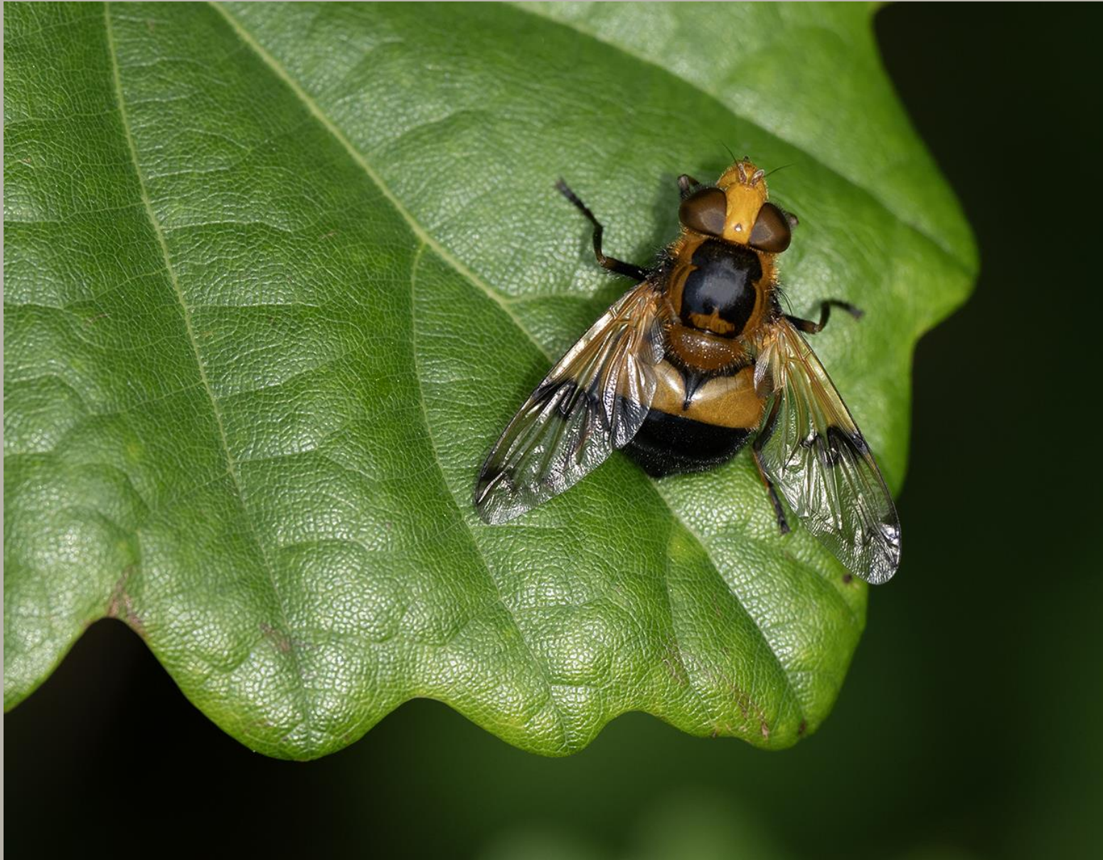
Orange-belted Plumehorn ( Volucella inflata )