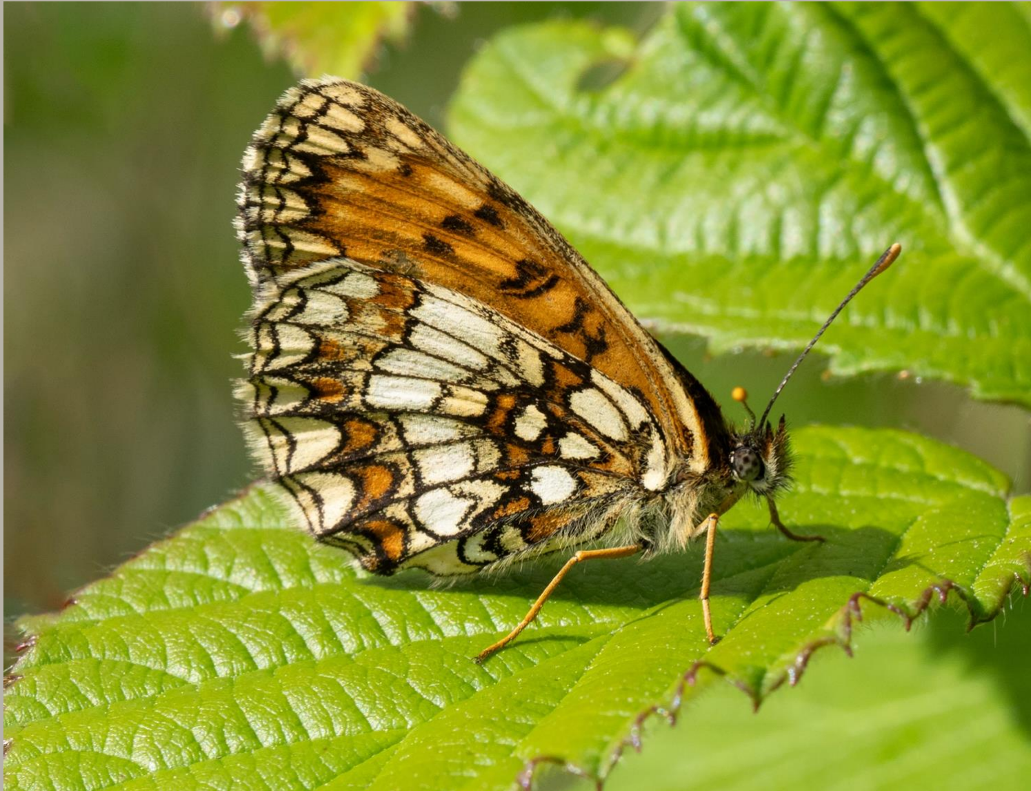
Heath Fritillary ( Melitaea athalia ) Underwing.