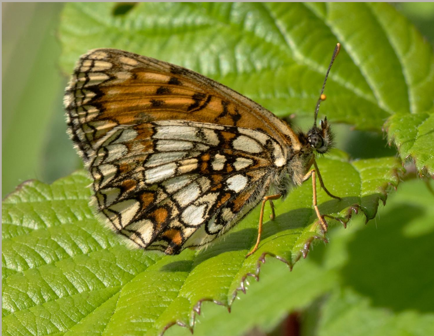
Heath Fritillary ( Melitaea athalia ) Underwing.