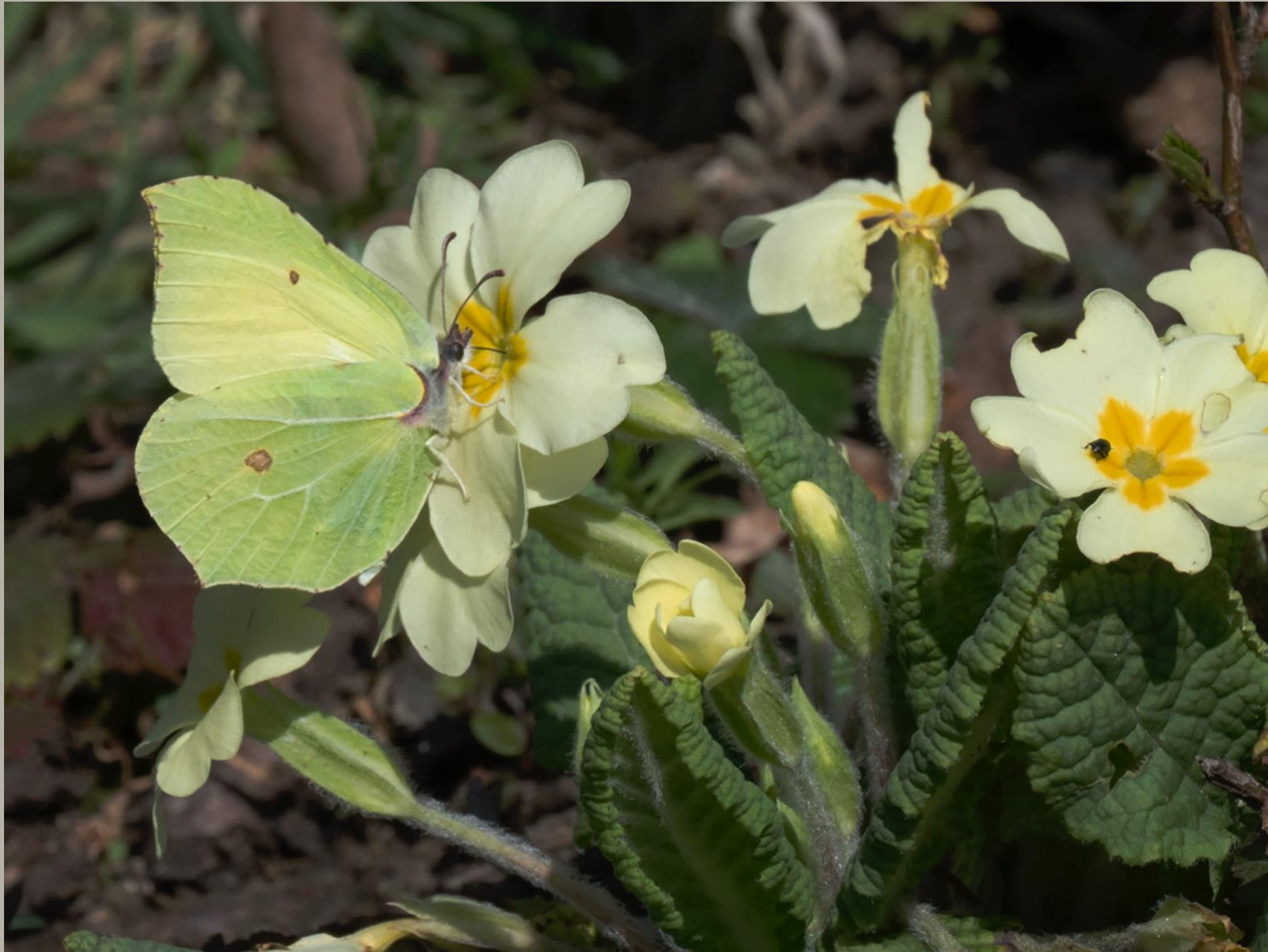
Brimstone ( Gonepteryx rhamni ))

Orlestone Forest, Faggs Wood - March '25