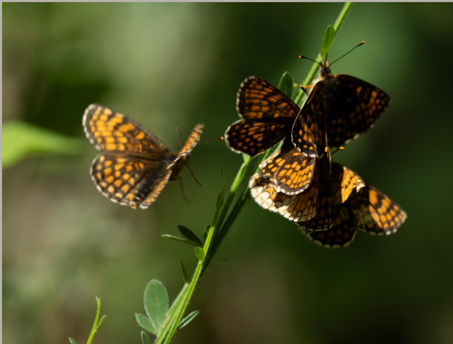
Heath Fritillaries ( Melitaea athalia )