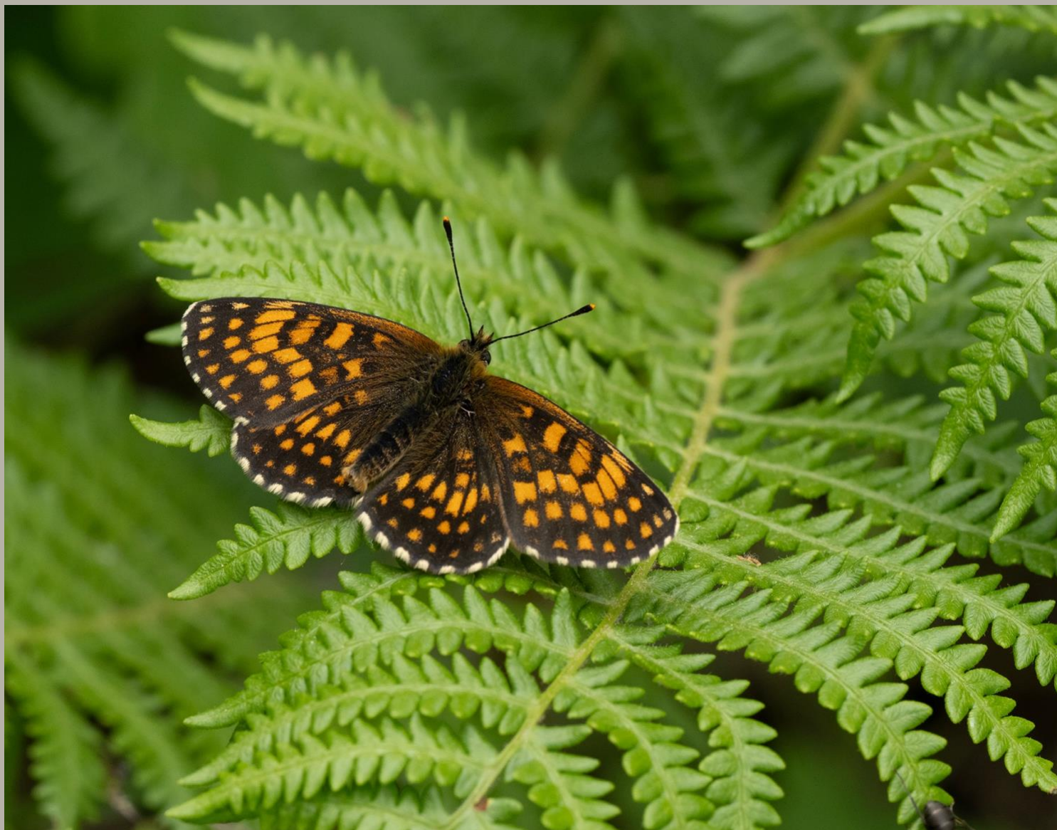
Heath Fritillary ( Melitaea athalia )